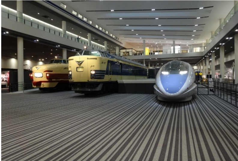
Kyoto Railway Museum

In a fun packed day that is sure to delight both adults and children, this tour will take you to the centrally located Kyoto district of Umekoji, where you'll be able to enjoy both Kyoto Railway Museum and Kyoto Aquarium. These world class facilities, located in a former freight depot, have something for everyone – meaning this trip is equally rewarding for railway and ocean enthusiasts of any age. Memories of the train driving simulator, and the vast aquarium tanks will stay with you forever.