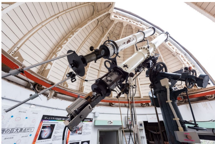
"Sartorius 18cm Refractive Telescope," Japan's oldest telescope that is still used for scientific research

Kwasan Observatory: This astronomical observatory, is nicknamed the "The Home of Amateur Astronomy" as it is considered to be the foundation of modern astronomy in Japan today. Inside the Main Building equipped with a dome spanning 9m diameter, it has a 45-cm-diameter telescope—the third-largest refracting telescope in Japan. You can also visit the history museum and other places that display observation materials and items of interest. It is usually private and only accessed for academic purposes, but is being opened especially for ICOM Kyoto 2019 participants.