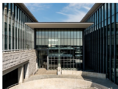
Hyogo Prefectural Museum of Art (Ando Gallery)