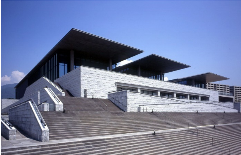
Hyogo Prefectural Museum of Art

A must for lovers of contemporary architecture is this visit Hyogo Prefecture's two buildings designed by a world-renowned architect, Tadao Ando: Awaji Yumebutai and Hyogo Prefectural Museum of Art. At the museum, we will see the special exhibition of the Yamamura Collection centering on the works of artists of the GUTAI group, who are gaining international attention, and the Ando Gallery, which was added to the museum in May 2019. On the way to Awaji Island, we will enjoy spectacular views as we cross the Akashi Kaikyo Bridge.